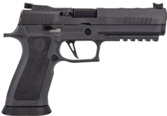
Sig Sauer P320 XFIVE Legion 9mm Luger Item Number 320X5-9-LEGION-R2 MSRP $1,099.99

Tickets are $10 each or 3/$25. Tickets purchased as 3/$25 MUST be to the same person. You do NOT have to be a member to purchase tickets. Tickets are available for purchase at the range office or shooting desk