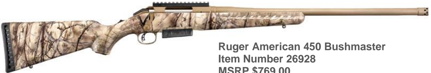
Ruger American 450 Bushmaster Item Number 26928 MSRP $769.00