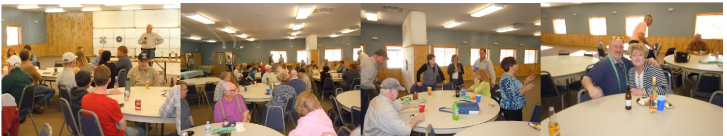
Winter League Banquet Photos