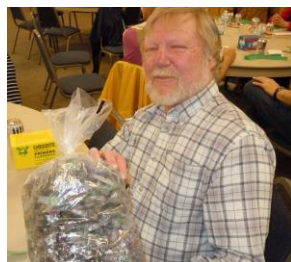
Once fired wads all gages.